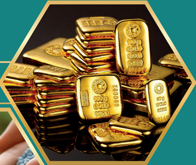
Gold and Non Manufactured Precious Metal